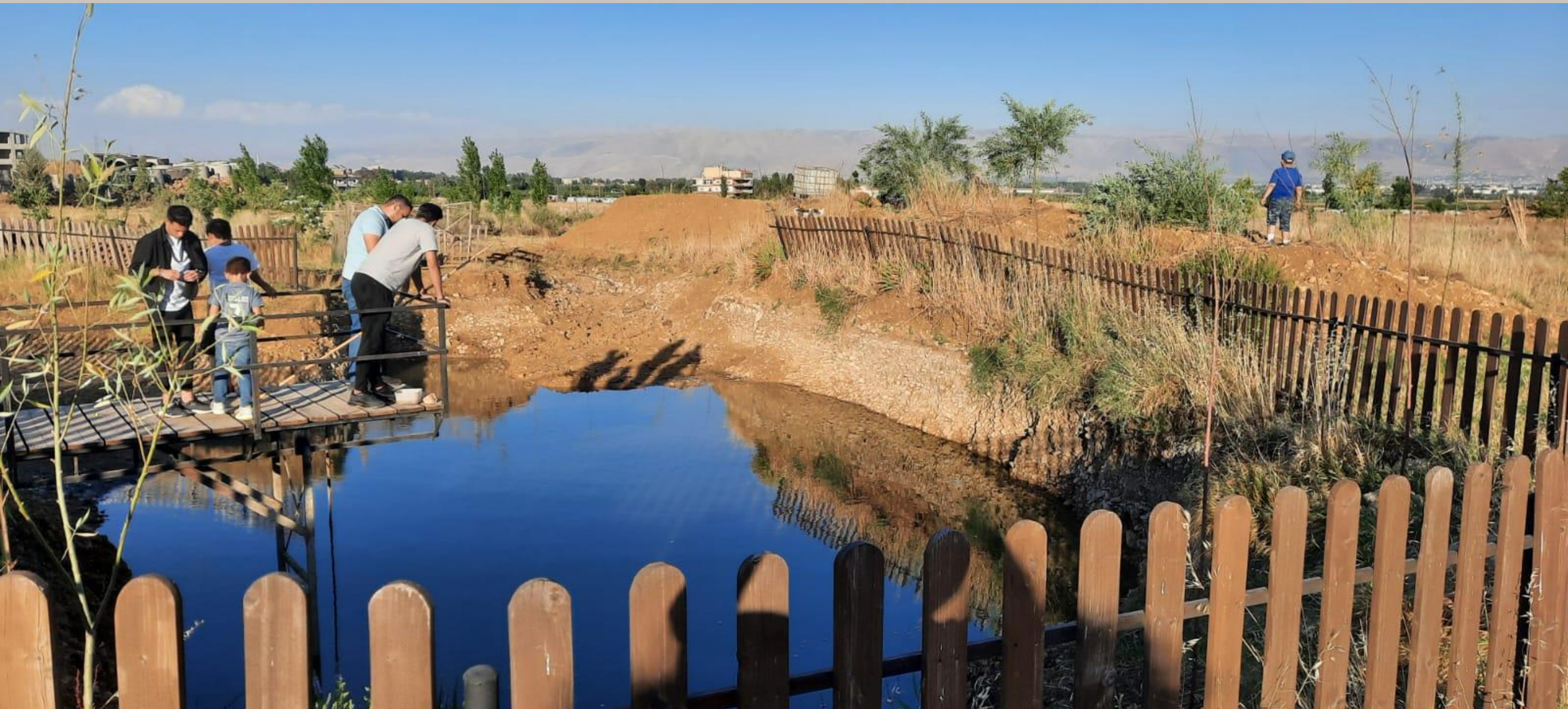
Angling session to move fishes from the habitat pond to two other ponds.