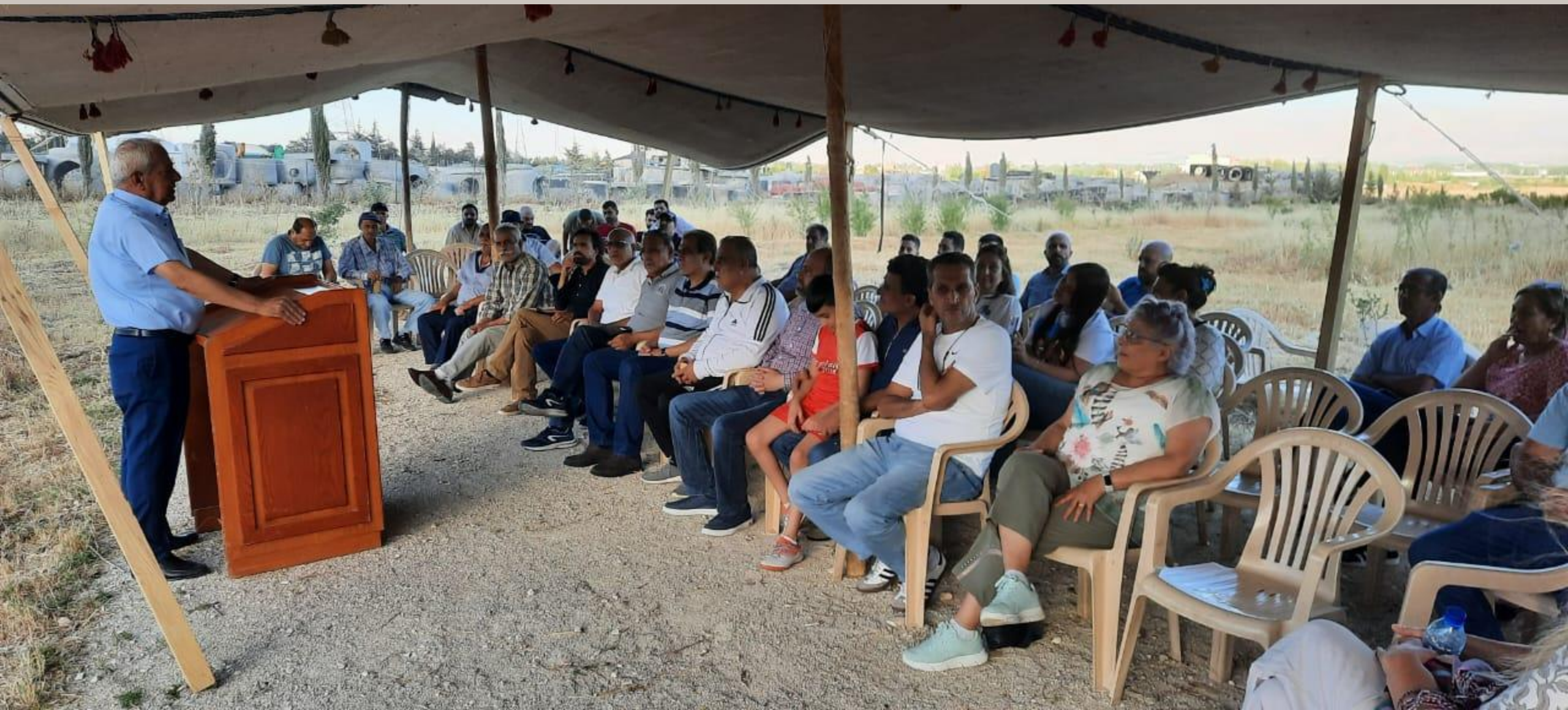
The mayor Atif al-Mays insists on the destiny of the garden: “it is meant to benefit to next generations”