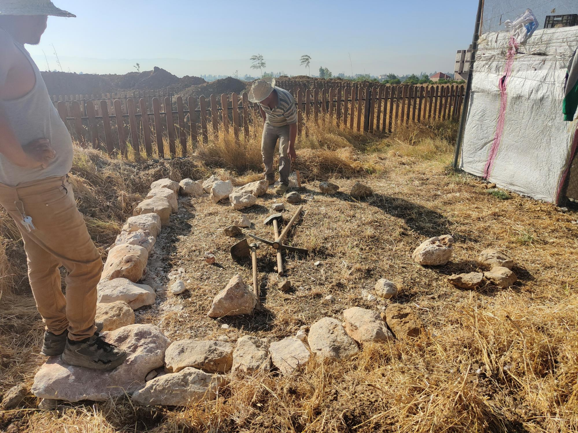
... with the building of a chicken coop and a dovecot