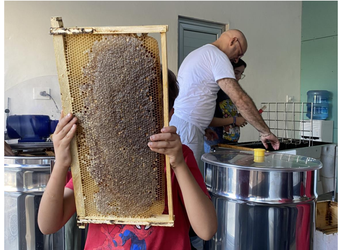
... and September was the time of the harvest