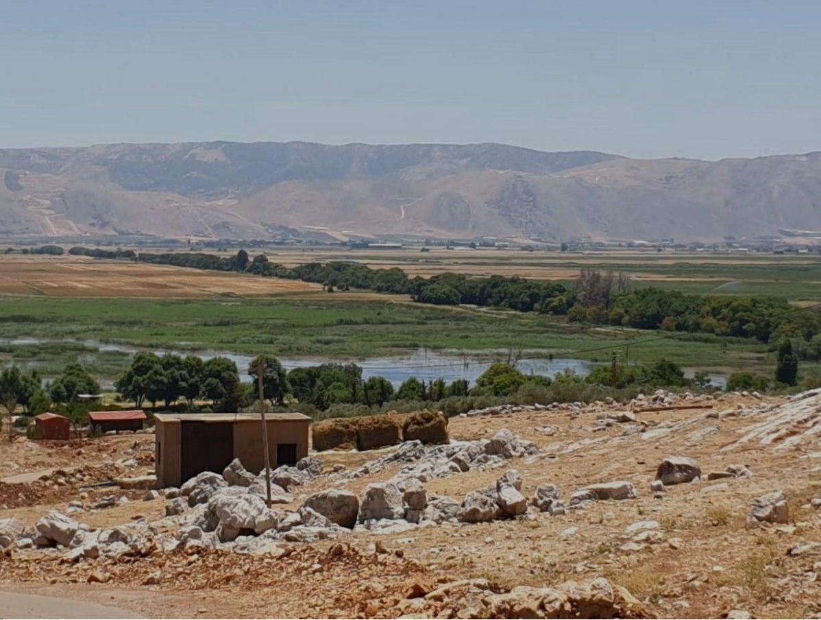
Aamiq, summer 2022