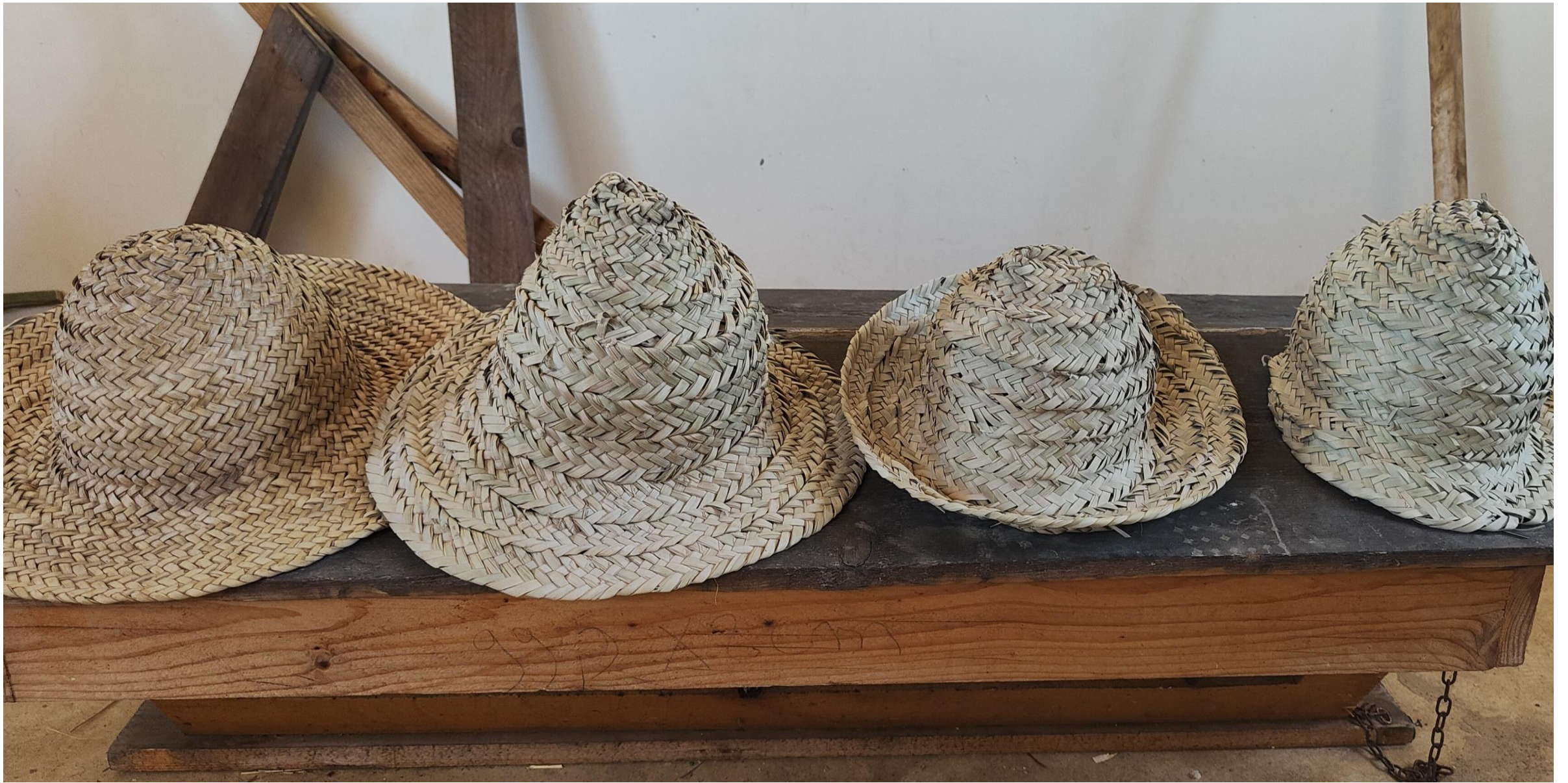
First productions by the Mekse team