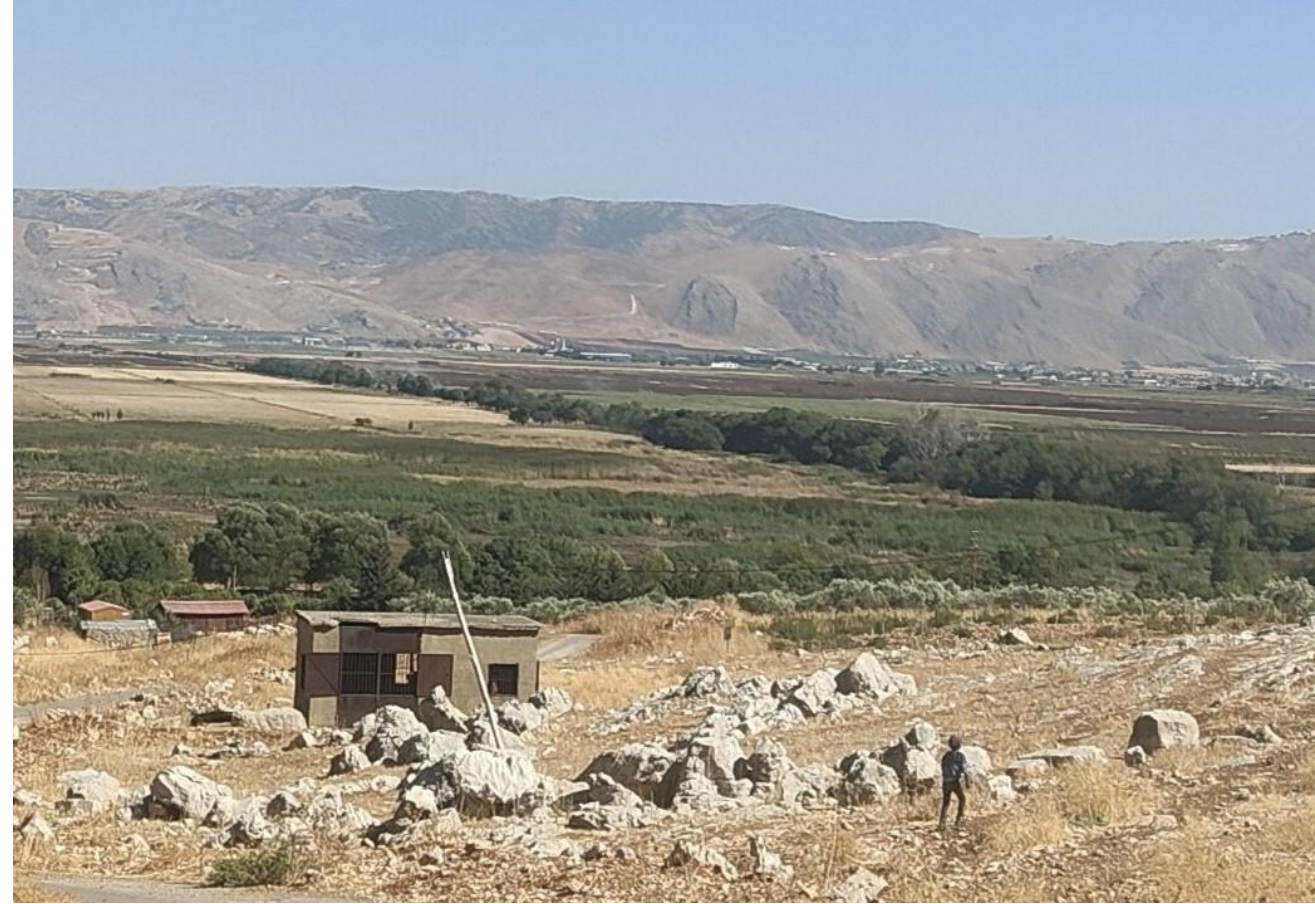
Aamiq, summer 2023

In Aamiq wetlands where A Rocha Lebanon brought back the water in the 2000', the drought is there again.