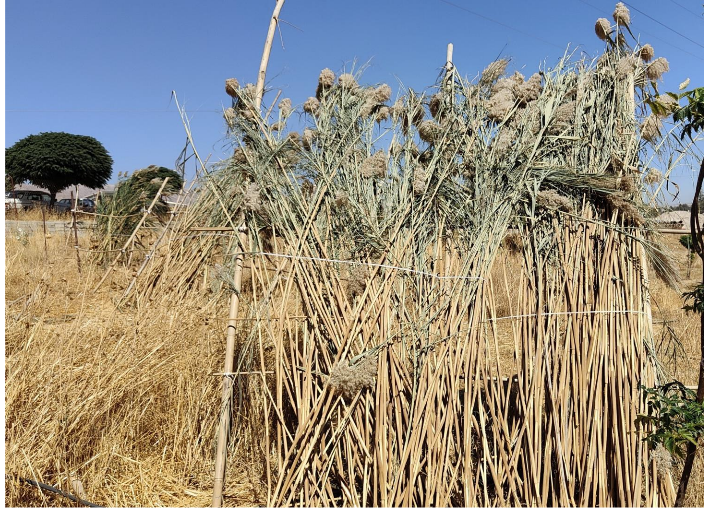
Bambou and reed wind cuts to create microclimate