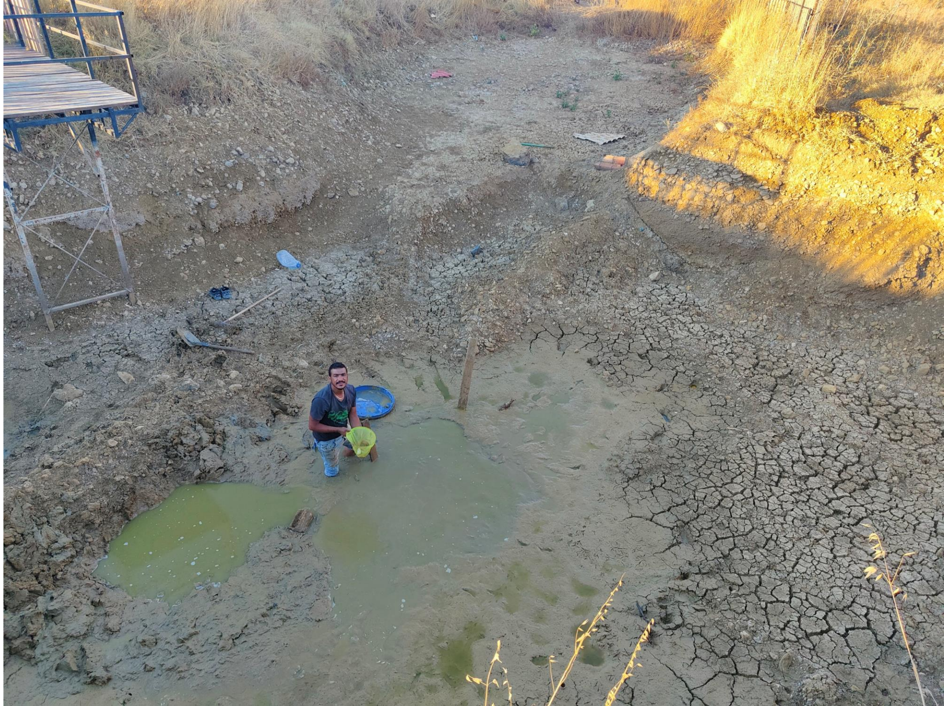
Hamzeh saving hundred of fish from the habitat pond in Mekse...