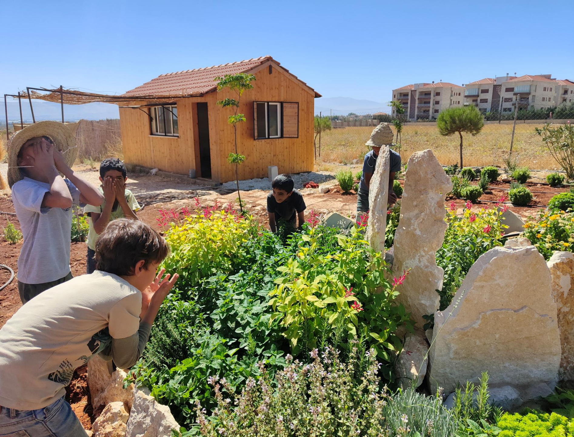
The fountain of fragrances