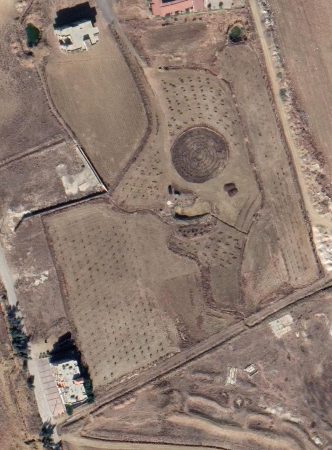
Late Summer 2017