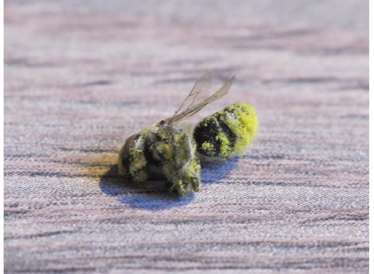
Megachile – this genus of leafcutter bees collects the pollen beneath their abdomen