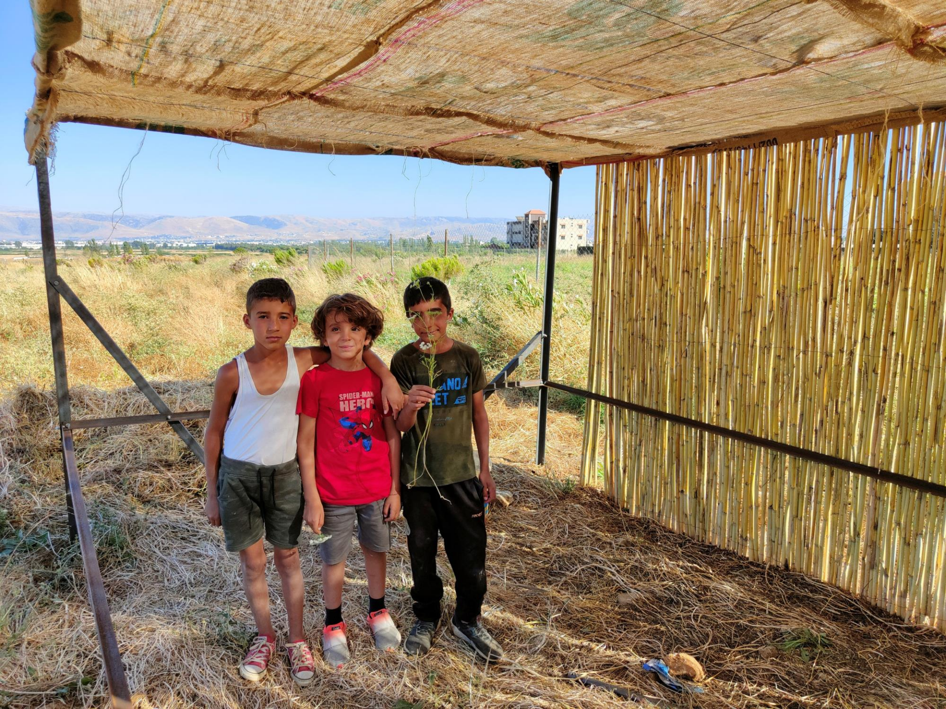
A new model of tree nursery