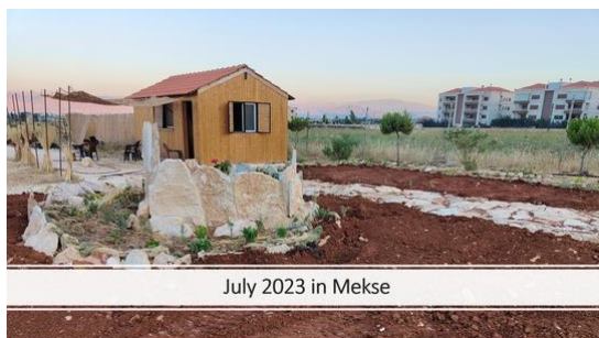
July 2023 in Mekse

Mekse. Watering, mulching, but also planting, developing the irrigation system, building a path and a tree nursery, all the gardening in pictures on the link below.