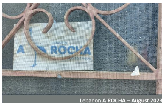
Lebanon A ROCHA – August 2023