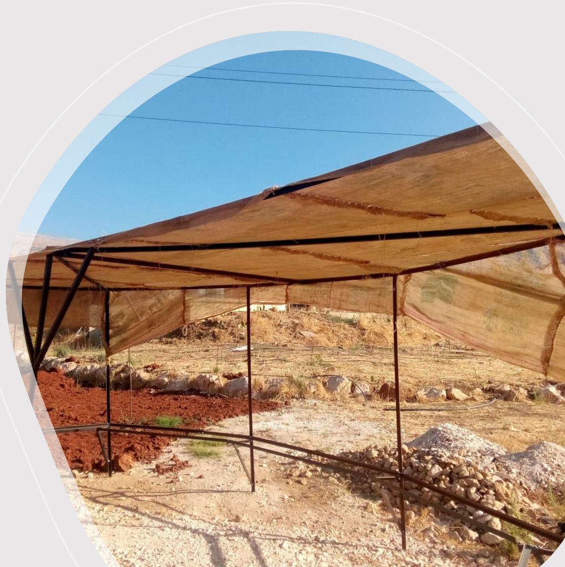
A new shelter: the Sannine hut