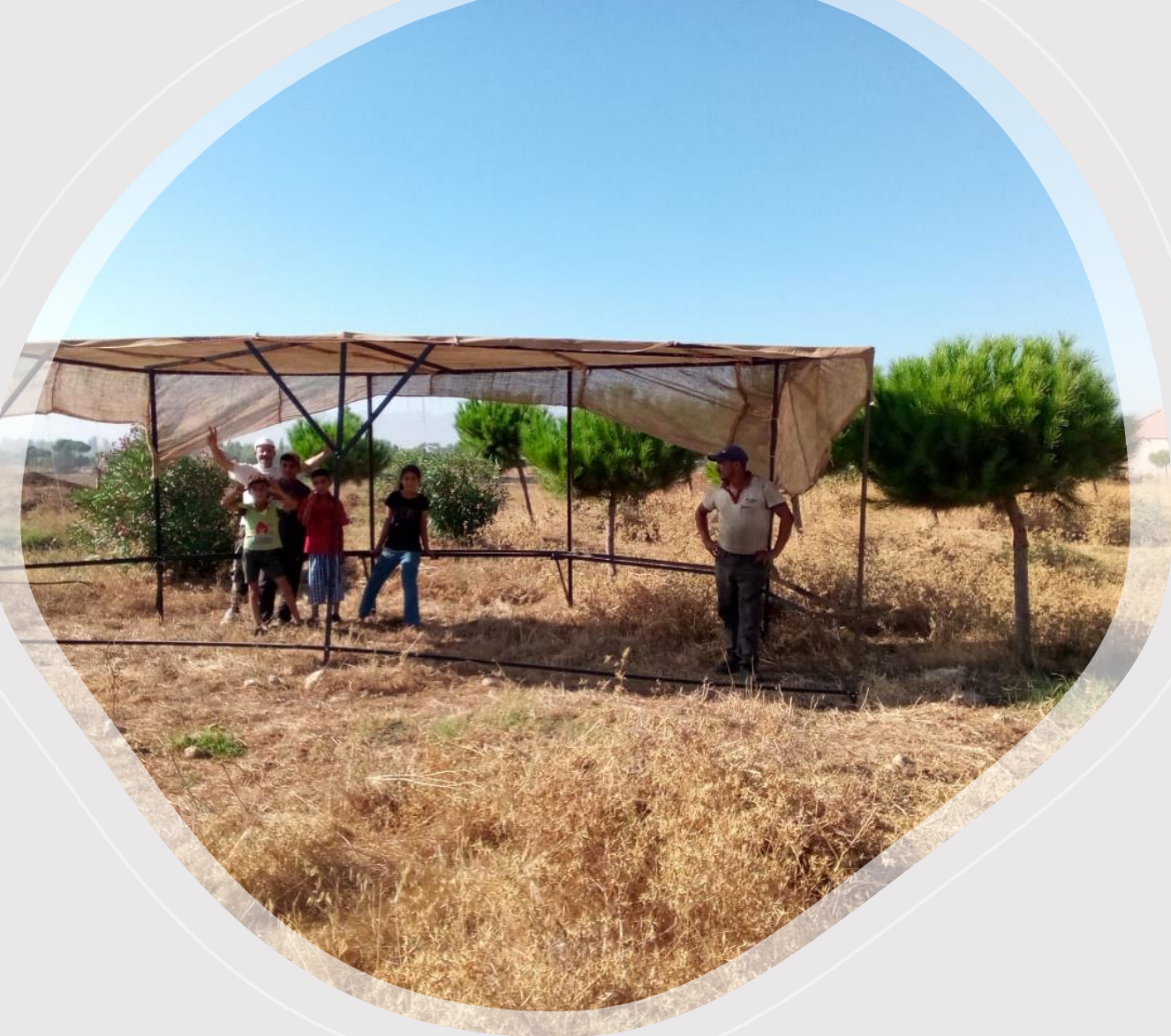
A new shelter: the Sannine hut