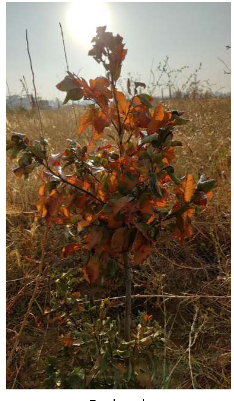
Dry Juda tree Dry medlar Dry laurel