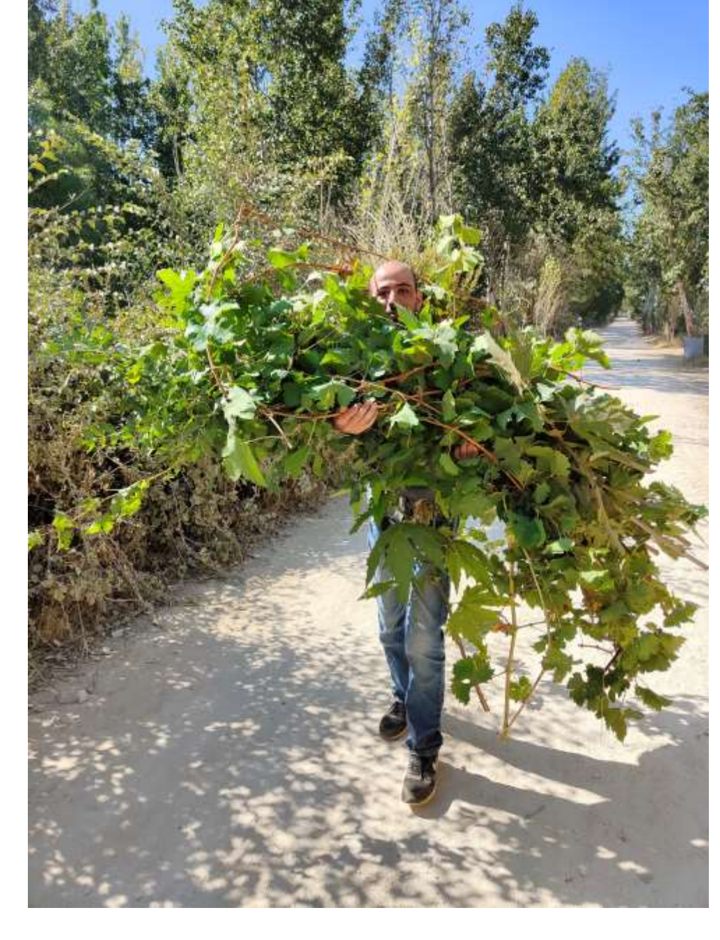
Cutting operation in Taanayel