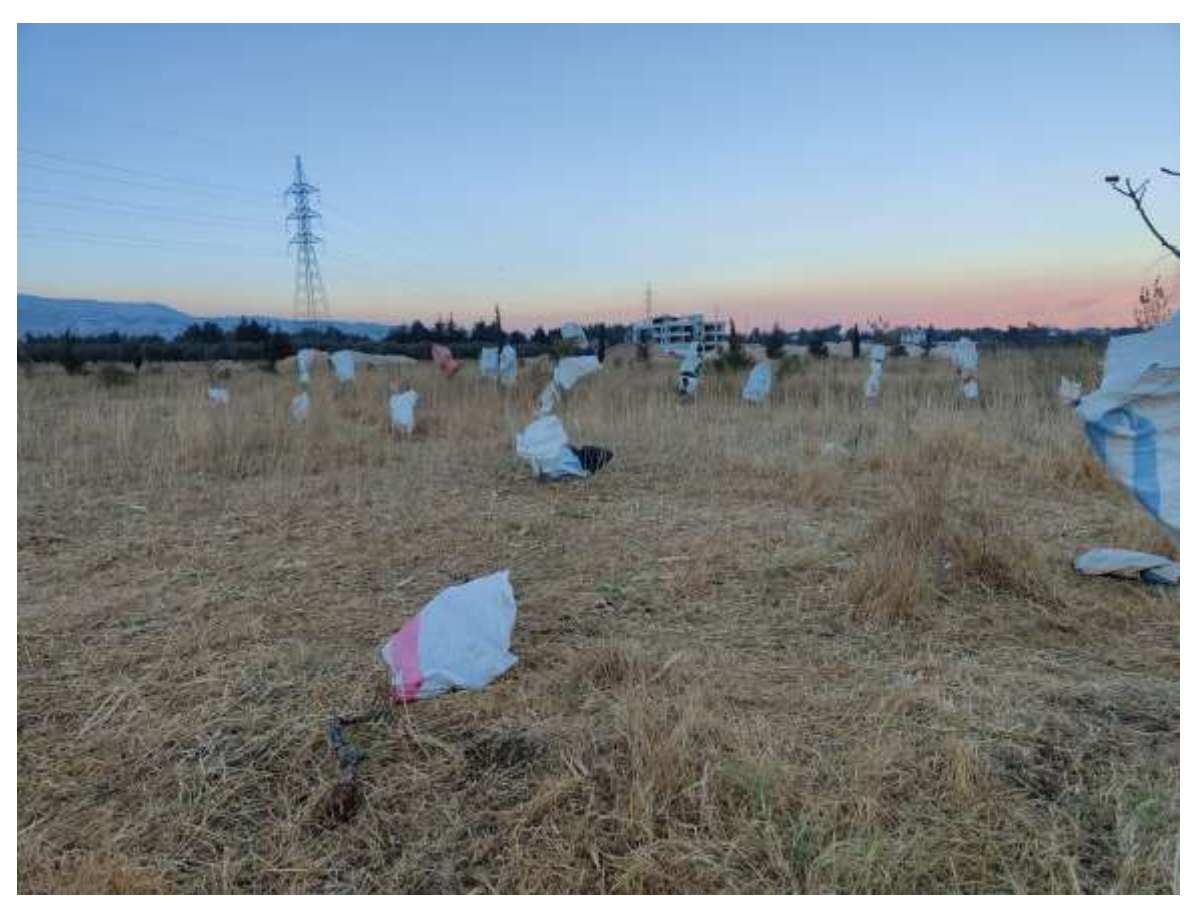
After two days of grazing.