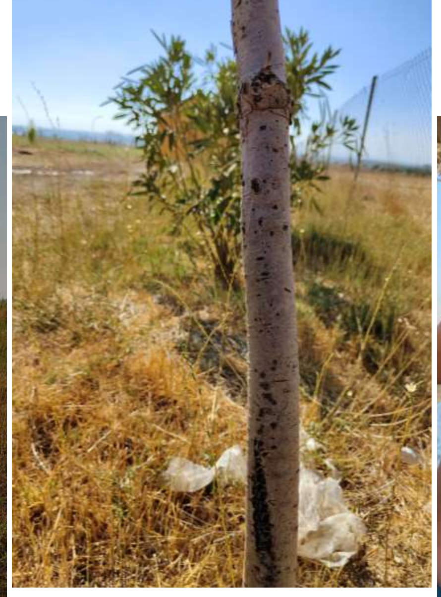
Meditation on a pine tree