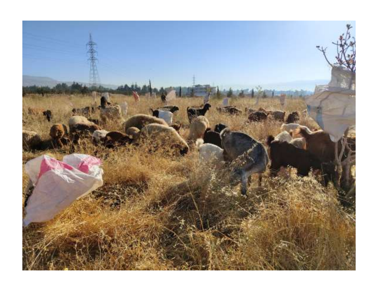
... the cleaner herd