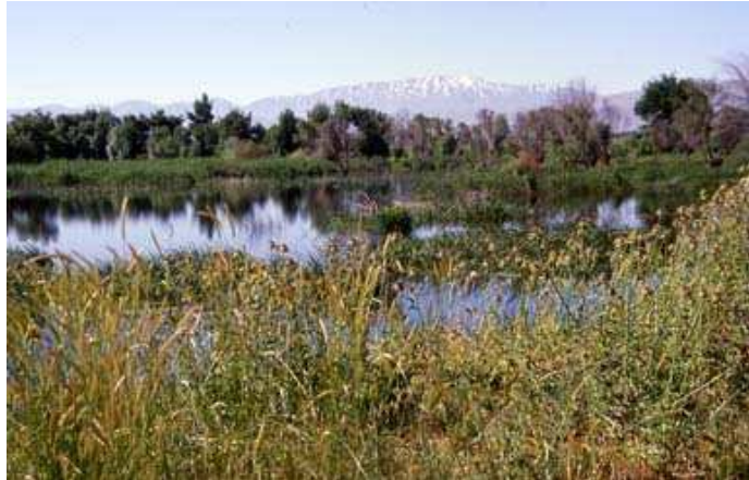
Fig. 2 Looking west across Aammiq Marsh.

Historically the wetland used to cover a large proportion of the Bekaa plain, reaching northwards up to thirty kilometres from its current extent. However, because of the high fertility of the Bekaa soils, parts of the plain have been converted to farmland since ancient times. The last major effort to drain the wetland for agriculture occurred during the 1960s and early 1970s, with the digging of an extensive network of drainage ditches across the plain, and building of levees around the Litani